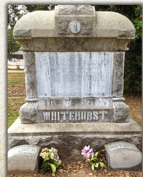
Whitehurst plot at Gavilan Hills Memorial Park