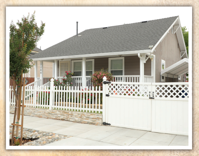
7280 Rosanna Street painting and sensitive renovation

7542 Monterey Road façade painting and tile