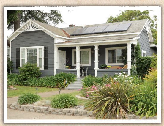
7721 Church Street