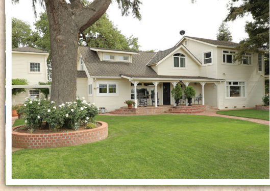
100 Cohansey Avenue