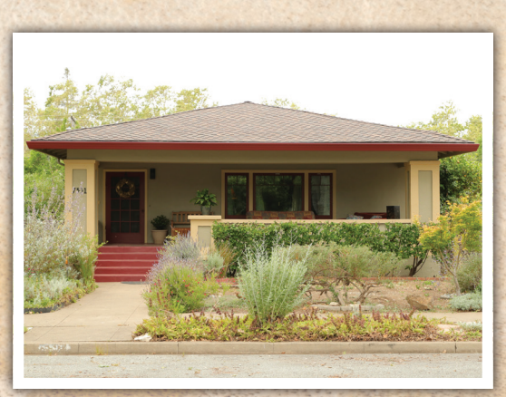
7551 Hanna Street