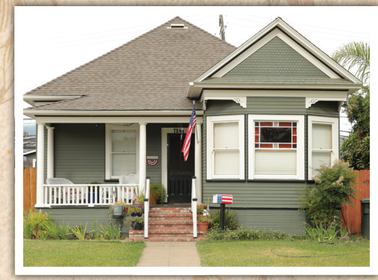
7561 Alexander Street