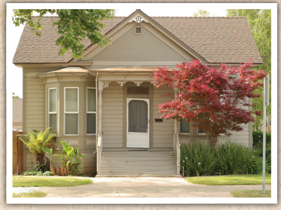
194 Fourth Street