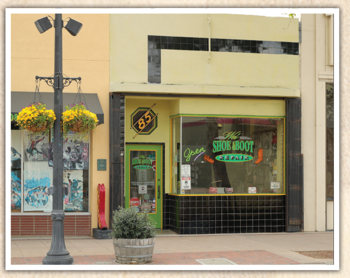
7485 Monterey Street