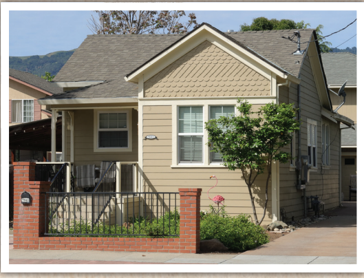
7041 Church Street