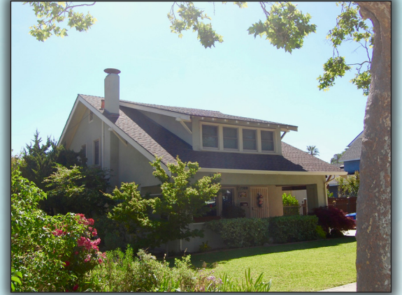
7580 Hanna Street