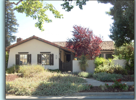
7740 Hanna Street