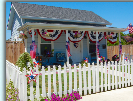
7249 Rosanna Street