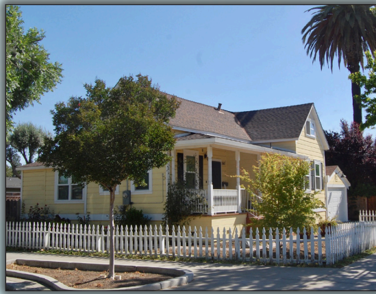
307 East Sixth Street