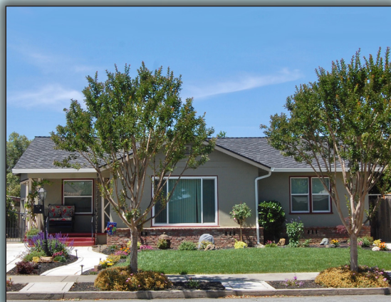
7651 Carmel Street