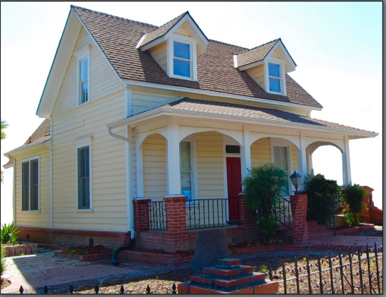
7190 Church Street