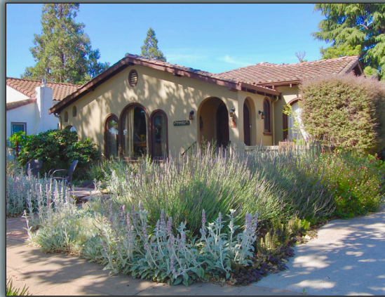
7441 Hanna Street