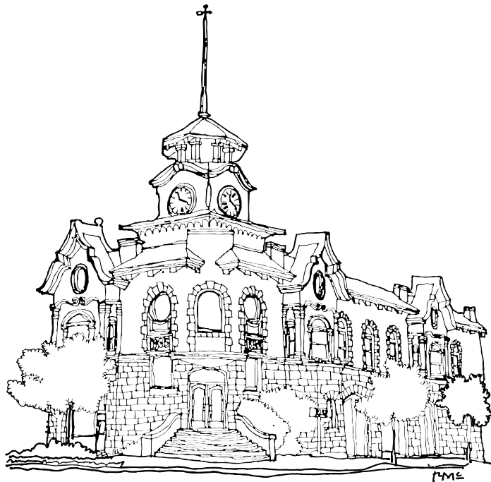
Old Gilroy City Hall (1905)