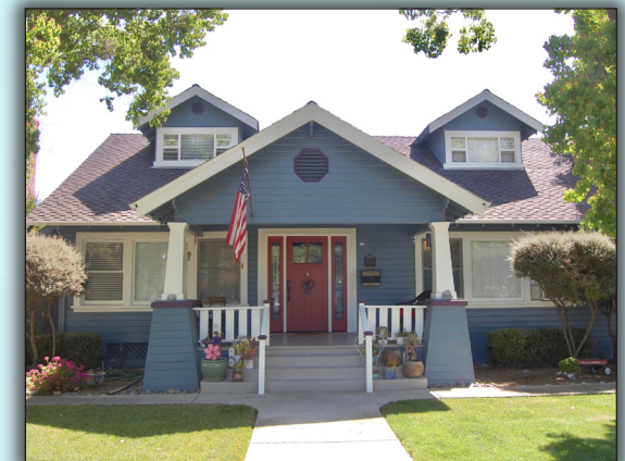
7550 Hanna Street