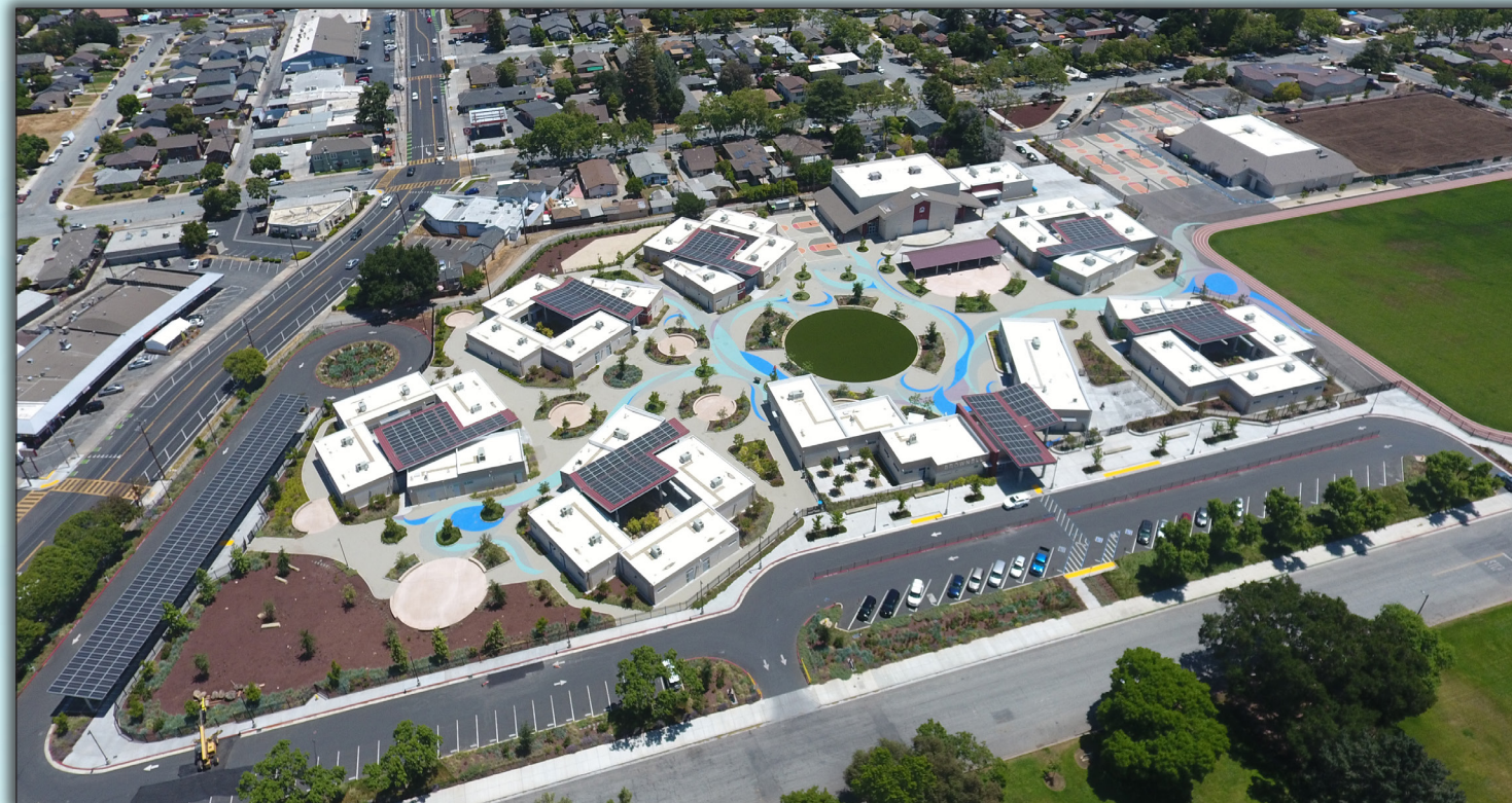
New Brownell Middle School

This year we are also giving a special award to the NEW Brownell Middle School , a project funded by the voters of Gilroy and developed by Gilroy Unified School District and Aedis Architecture. It exemplifies the best in modern architecture and building techniques, incorporating solar panels, bioswales, safety and communication enhancements, new athletic fields, a rebuilt cafeteria and food prep kitchen that will help the other schools in the district. The students and staff are excited to get into the new building this fall.