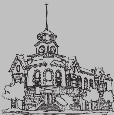
Old Gilroy City Hall - 1905