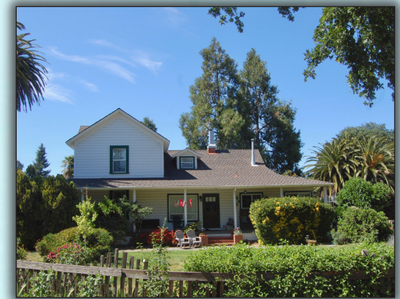
7290 Holsclaw Road